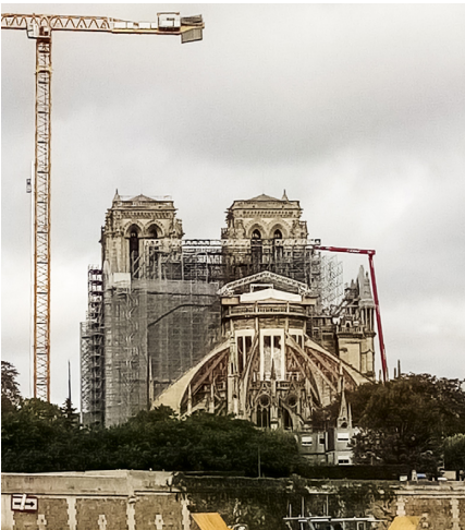
Poor Notre Dame

In next to no time we joined the Seine where for five days we wound our way to what was, for us, the holy grail, Rouen, for it was here that the mast would be raised. The last lock is a good 60km above Rouen and it was strange to think that