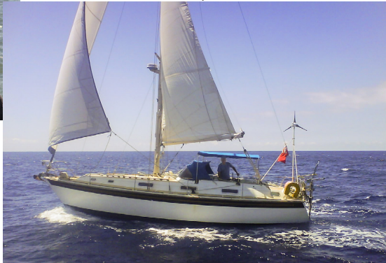
Hobo , a Westerly Corsair