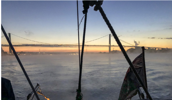
Tancarville at dawn

Dawn came as we sailed under the Tancarville bridge and passed Honfleur onto a calm and sunny sea. The passage to Plymouth was textbook. 5.5 knots over the ground while sailing at five. Pleasant views of Barfleur and Alderney during the night. Start Point showing up earlier than thought.