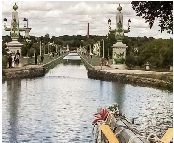
Approaching the Haussman aqueduct over the Loire

The Lateral a la Loire is a very pleasant canal, when conditions are good. The weather was lovely but the water seemed a little scanty. It wasn't till halfway through the next day that I learned, to my chagrin that the canal was only being maintained at 1.4 metres; as we drew 1.55 in sea water, the horror of the next task became clear. We were at écluse (lock) 10 and the situation continued till the 21st. One ray of hope was